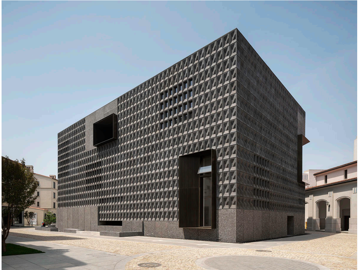
Aranya Art Center, Qinghuangdao, China.

With design confidence, they create exciting, sometimes surprising spatial constellations – from found and recycled materials or building parts of the respective location and by adding new elements. Historicising set pieces are omitted, while the charm and character of the 'old' remains legible and tangible and thus identity-forming in Neri&Hu's positive reinterpretation of the nostalgic. Their transdisciplinary design approach is in the DNA of the studio.