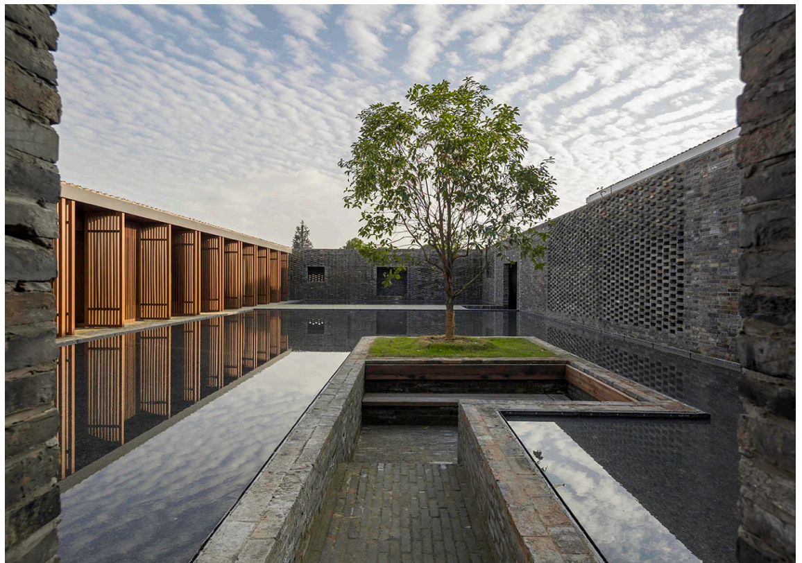
Tsingpu Yangzhou Retreat, Yangzhou, China.

The presented projects from more than 20 cities include: The Waterhouse at South Bund, Shanghai, China, Design Commune and Commune Social, Shanghai, China, Rethinking The Split House, Shanghai, China, Aranya Art Center, Qinhuangdao, China, Tsingpu Yangzhou Retreat, Yangzhou, China, Suzhou Chapel, Suzhou, China, Fuzhou Teahouse , Fuzhou, China, The Chuan Malt Whisky Distillery, Emeishan, China, Nantou City Guesthouse, Shenzhen, China, Singapore Residence, Singapore, Bow Street Boutique Hotel, London, UK, Papi Restaurant , Paris, France and Creative Office in Cologne, Germany.