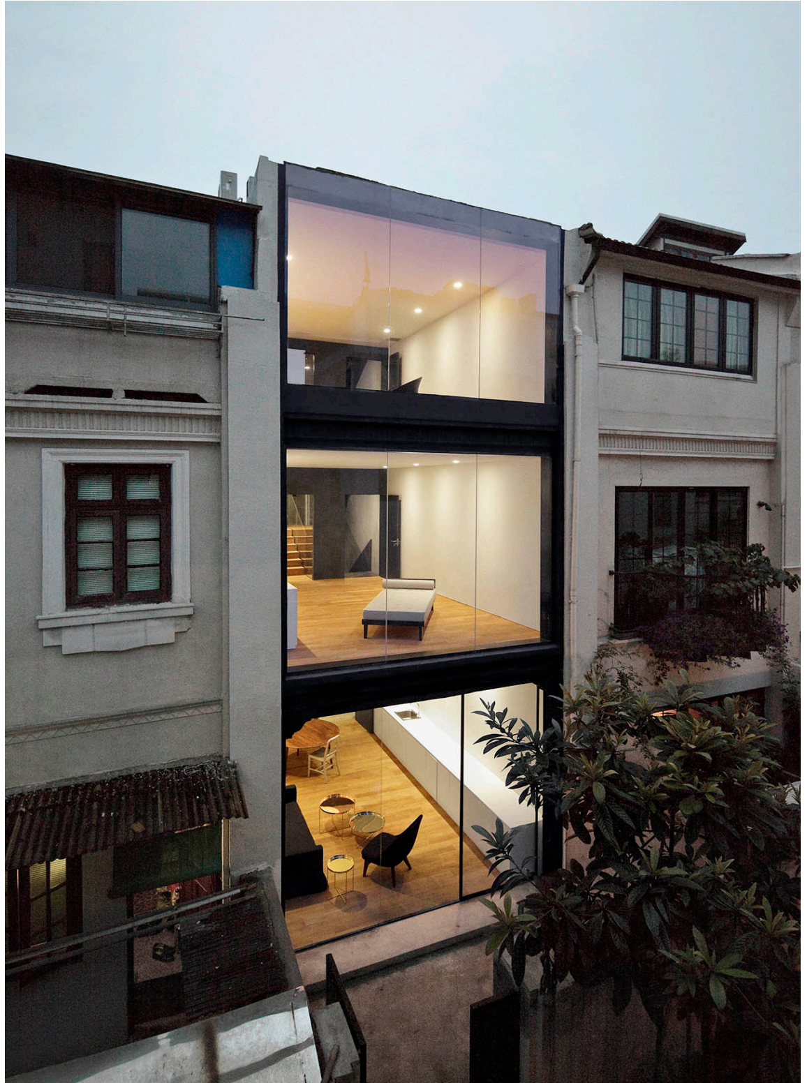
Rethinking the Split House, Shanghai, China.