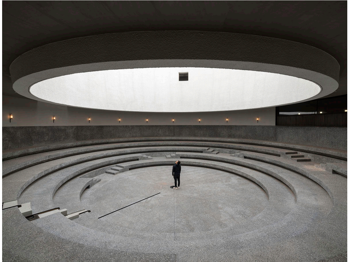
Aranya Art Center, Qinghuangdao.