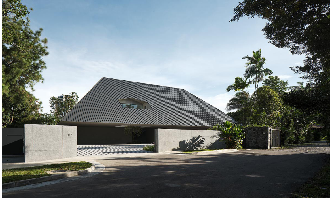
Singapore Residence, Singapore.