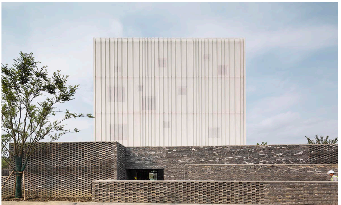
Suzhou Chapel, Suzhou Shi, China.

They take away the negative meaning of nostalgia and see it as a value. Inspired by the Russian-American scientist Svetlana Boym, Neri&Hu show that nostalgia has the potential to be constructive and not just reductive.