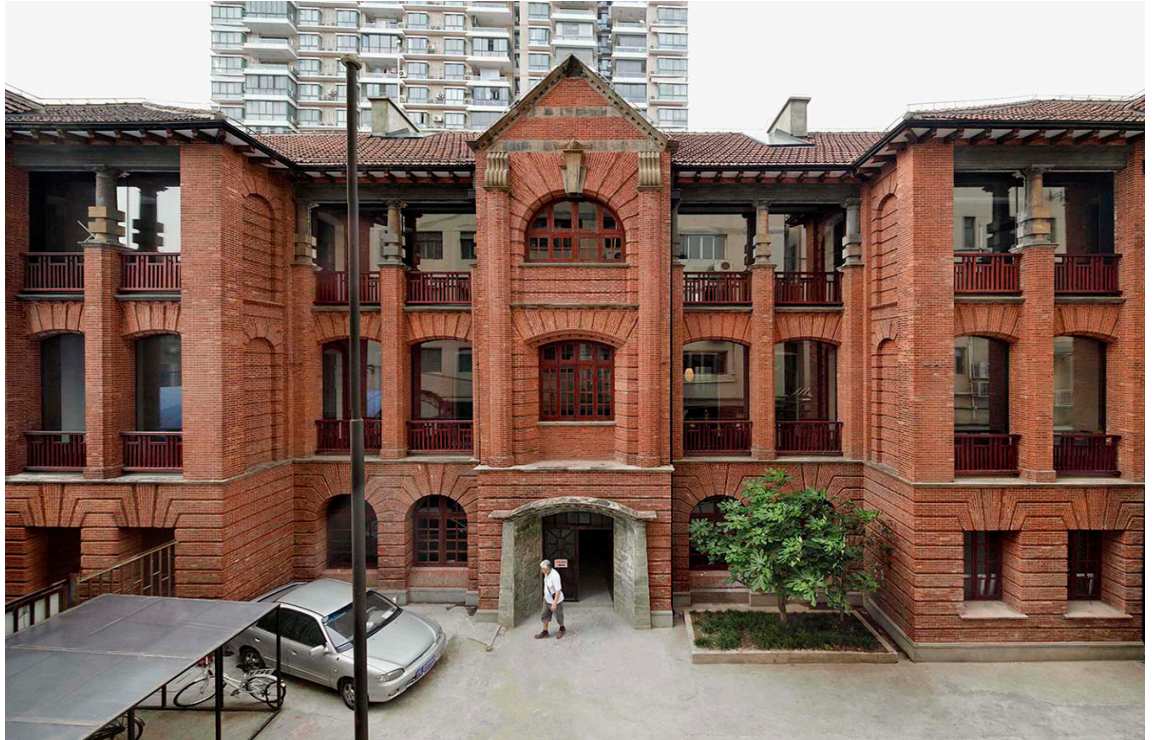
Design Republic Design Commune, Shanghai, China.

After more than two decades in which the Aedes Architecture Forum in Berlin has dedicated itself with great continuity to Chinese architectural culture, it can now be observed that an extremely exciting spectrum of architecture and design studios has developed since then that belong to today's Chinese avantgarde.