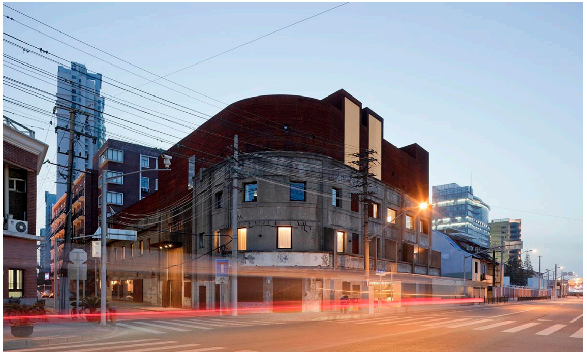
The Waterhouse at South Bund, Shanghai, China.

The studio's projects are expressions of the fascination of Reflective Nostalgia and are characterised by similar strategies such as the use of material contrasts, structural diversity and combinations of forms. However, each project has its own unique themes, for example in relation to dealing with the heritage from the French concession period in Shanghai (1849 to 1946), resistance to the commercialisation of false historical relics, or the role of representation in the polarity between past and present. In the works presented, one can sense the delicate balance between the contrasts of new and old, smooth and textured, refined and raw. Neri&Hu take up the challenge of Reflective Nostalgia by dealing with concepts and themes such as context, the role of the monument and the duality of destruction and development.