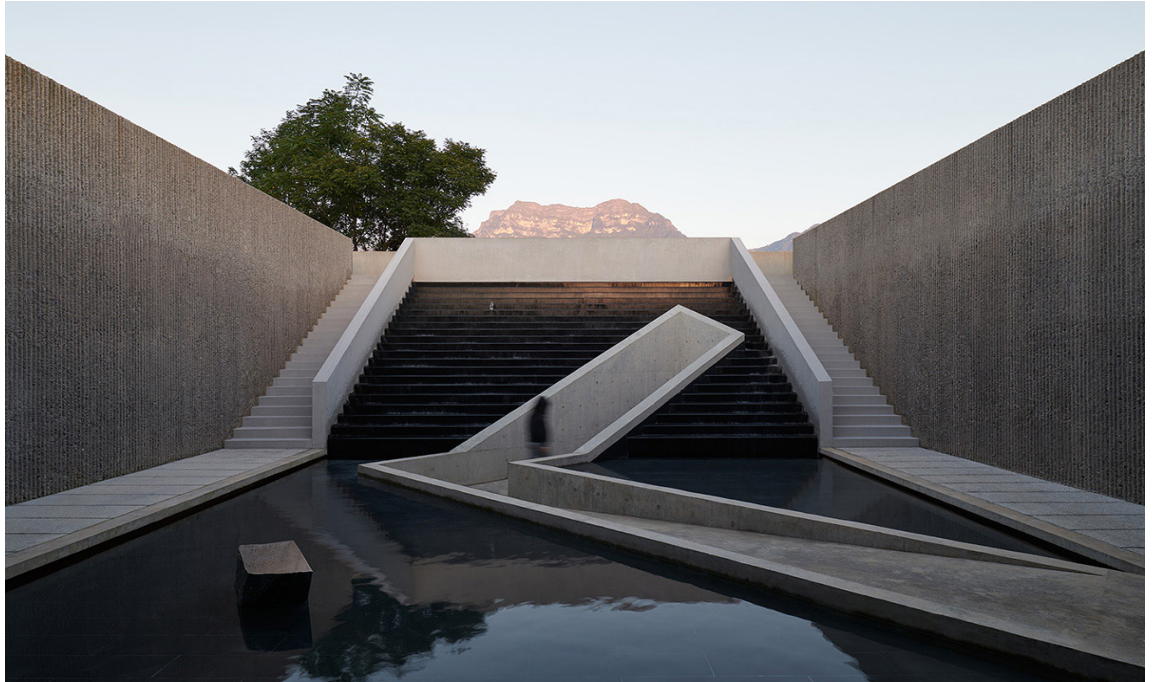
The Chuan Malt Whiskey Distillery, Emeishan, China.

Neri&Hu use Reflective Nostalgia as a method, a productive lens through which they have discovered an alternative reading of historical contexts as well as a new design process within that context.