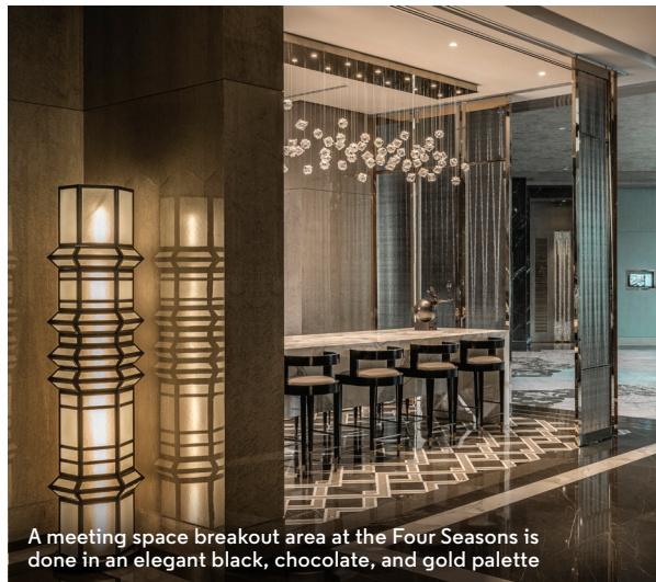
A meeting space breakout area at the Four Seasons is done in an elegant black, chocolate, and gold palette