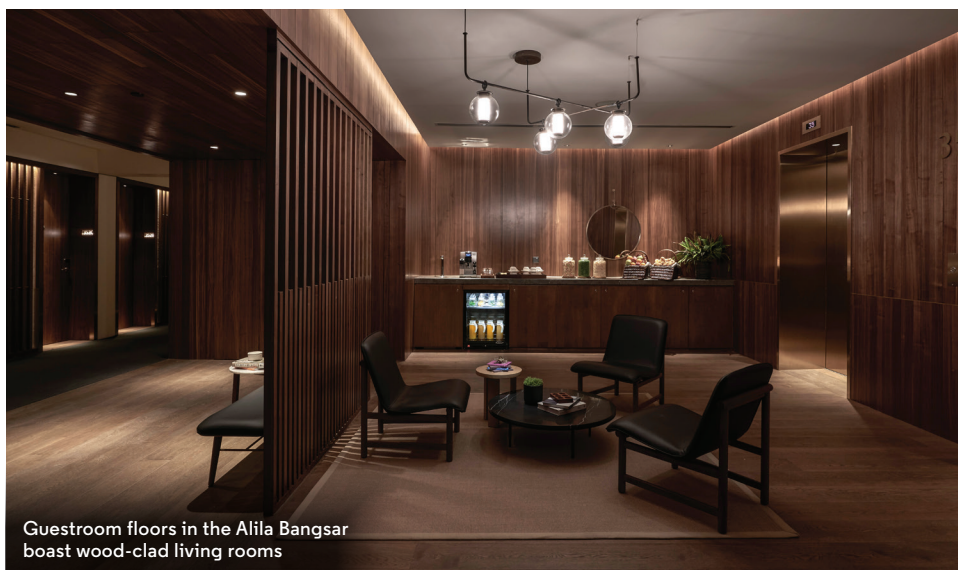
Guestroom floors in the Alila Bangsar boast wood-clad living rooms