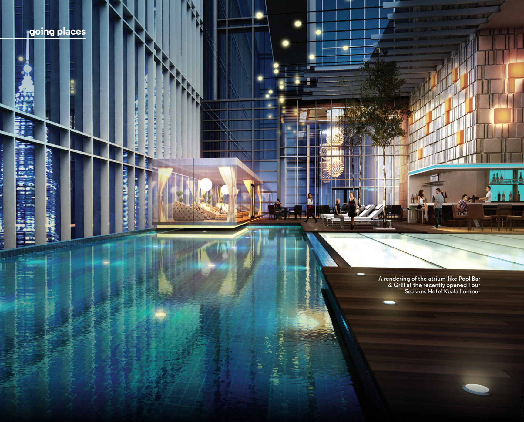
A rendering of the atrium-like Pool Bar & Grill at the recently opened Four Seasons Hotel Kuala Lumpur