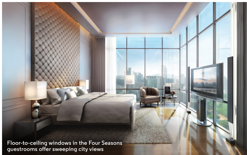
Floor-to-ceiling windows in the Four Seasons guestrooms offer sweeping city views